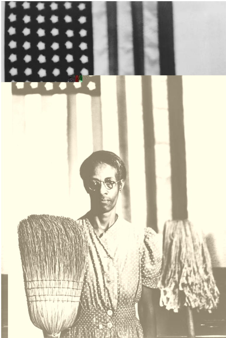
Gordon Parks, American Gothic . 1942

20 th Century American Photographers in the Capital Group Foundation Collection